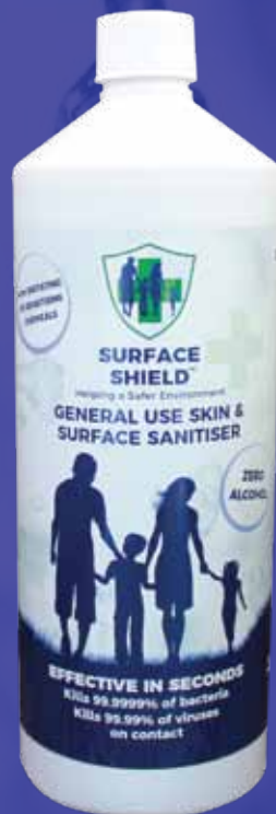
1 Litre Refillable Bottle