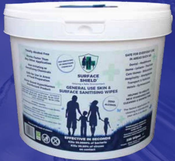
150 Wipe Tub