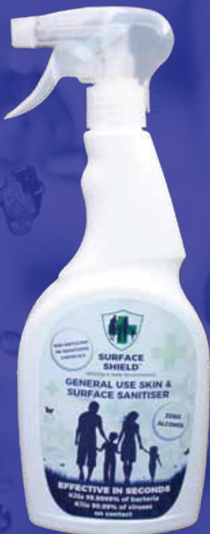
750ml Refillable Trigger Spray