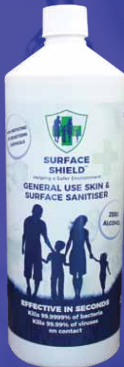
1 Litre Refillable Bottle