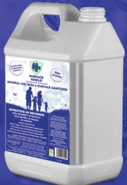
5 & 10 Litre Refillable Container

HELPING TO CREATE NEW STANDARDS FOR CLEANING & DISINFECTING